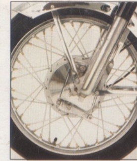
POWERFUL TWIN LEADING FRONT BRAKE