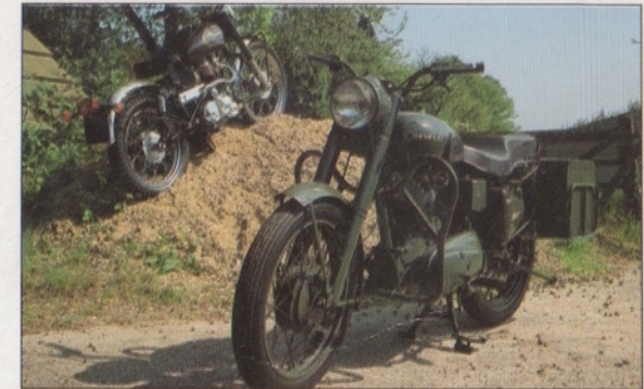
OFF-ROAD BULLET TRIALS AND ARMY MODELS BOTH AVAILABLE BY SPECIAL ORDER